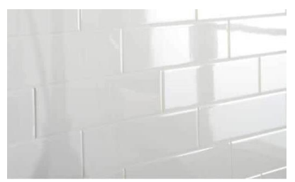
Backsplash: 3x12 Catch Ice Subway Tile