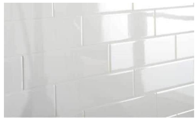
Tub/Shower Walls: 3x12 Catch Ice Subway Tile