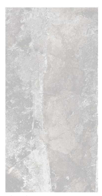
Floor Tile: 12x24 Cavanite Fawn