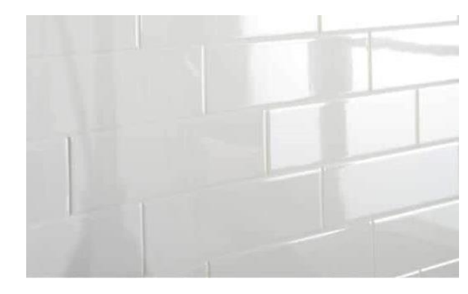
Shower Walls: 3x12 Catch Ice Subway Tile