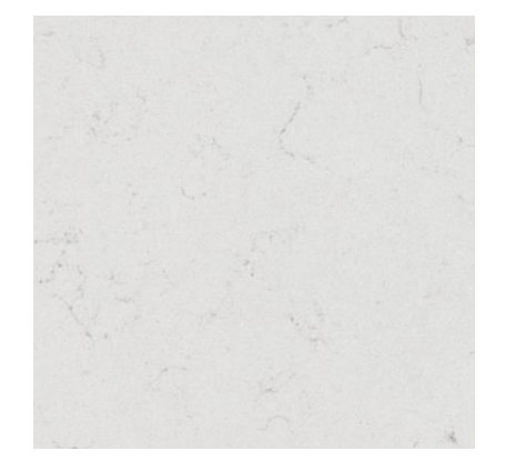
Countertops: Silestone Miami Vena Rectangular Sink(s)