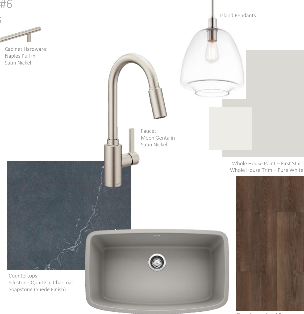
Sink: Blanco Valea Sink in Concrete Gray