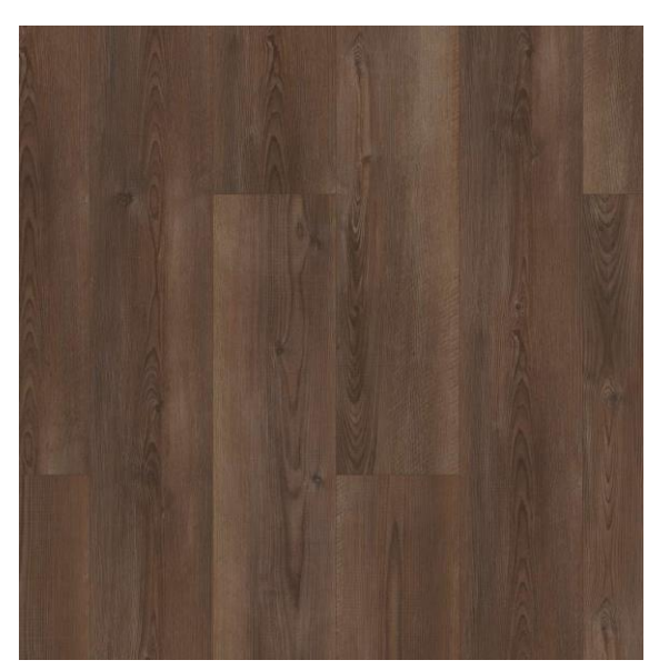
Shaw Luxury Vinyl Plank Polaris Plus – Ripped Pine