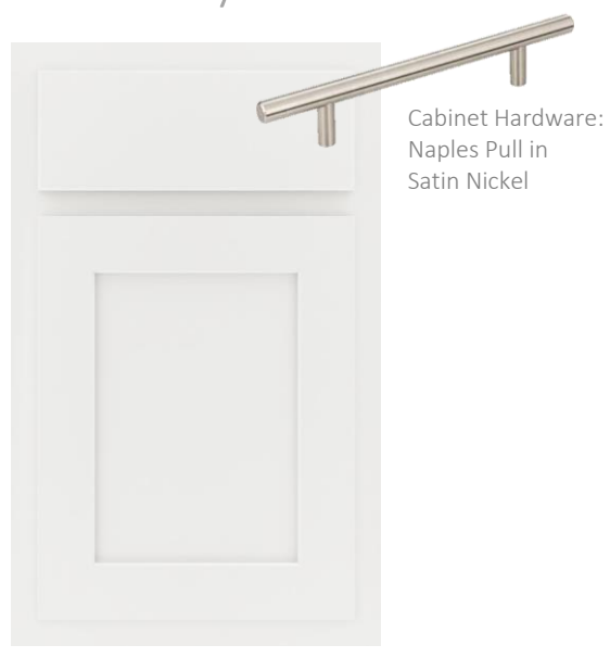
Cabinets: Westburke Painted White