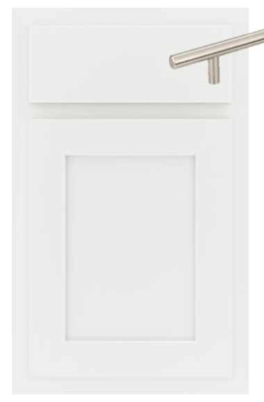
Cabinets: Westburke Painted White