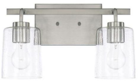
Powder Room Light (if applicable per plan)