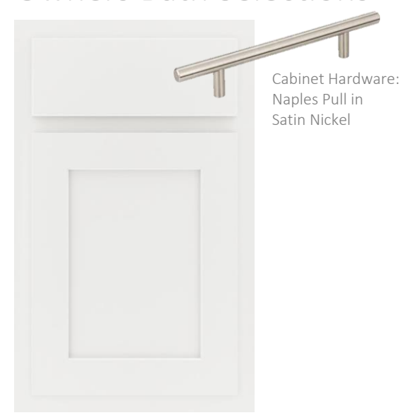
Cabinets: Westburke Painted White